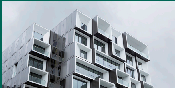
2018 1st Place Winner - Slate - Mixed Use