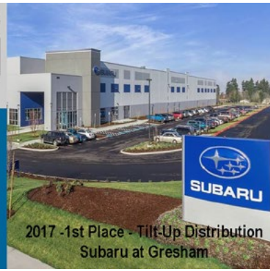
2017 -1st Place - Tilt-Up Distribution Subaru at Gresham

For the past 38 years, the Excellence in Concrete Awards Program (EIC) has showcased innovative and functional concrete applications used in our region's commercial, industrial, and residential projects.