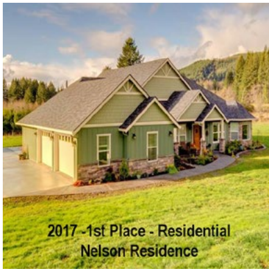
2017 -1st Place - Residential Nelson Residence